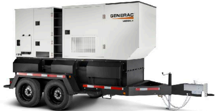
Picture shown may not reflect actual configuration.

*Assembled in the USA using domestic and foreign parts